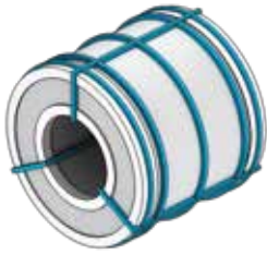
RS2 / 3 / 6